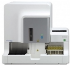
Arkray Aution AU-4050